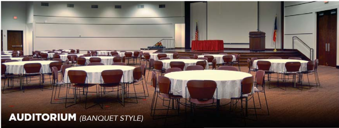
AUDITORIUM (BANQUET STYLE)