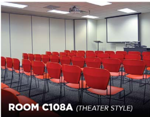
ROOM C108A (THEATER STYLE)