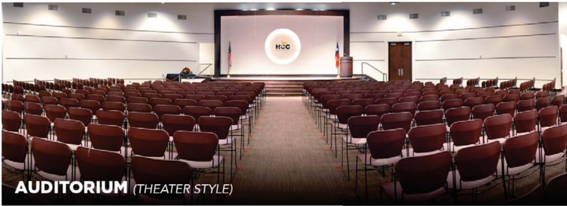
AUDITORIUM (THEATER STYLE)