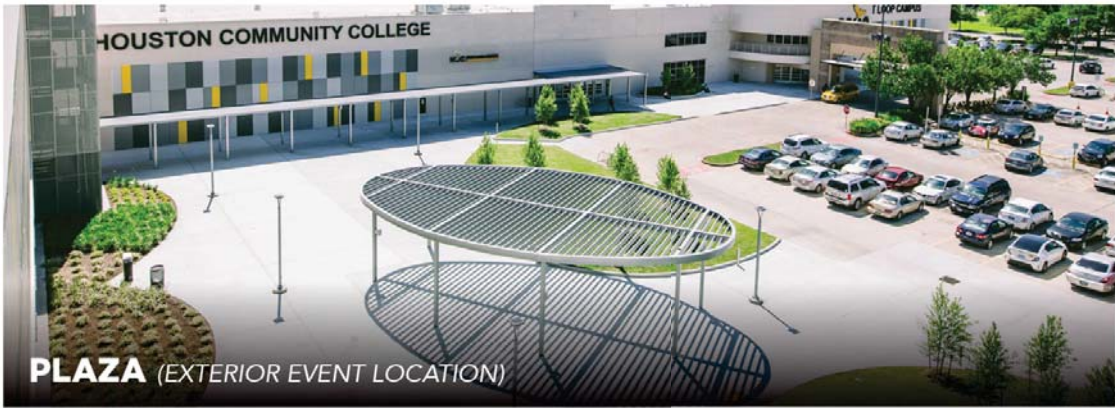
PLAZA (EXTERIOR EVENT LOCATION)