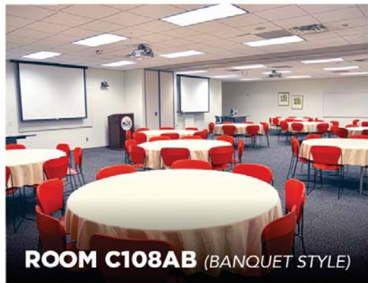
ROOM C108AB (BANQUET STYLE)