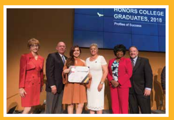
HCC Honors College celebrates the academic achievements of its graduates at an annual luncheon ceremony. Barnes & Noble College generously provides textbooks to students in the program.